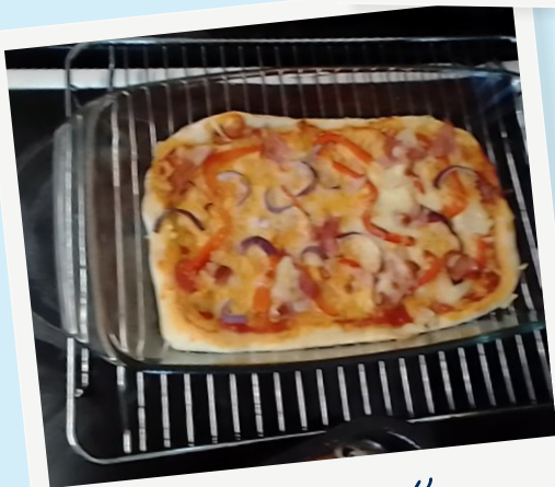
"The best pizza I've ever eaten!"