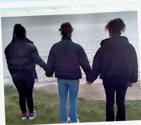
Cudmore Grove trip