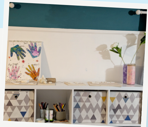
The finishing touches!